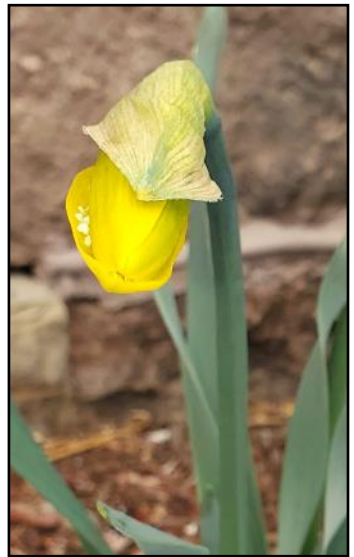
Snow granules nestle in a daffodil bud.