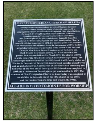
A sign with a brief history of FPC Helena has been installed near the Ewing St. entrance.

Worship Committee: No report submitted to Session.