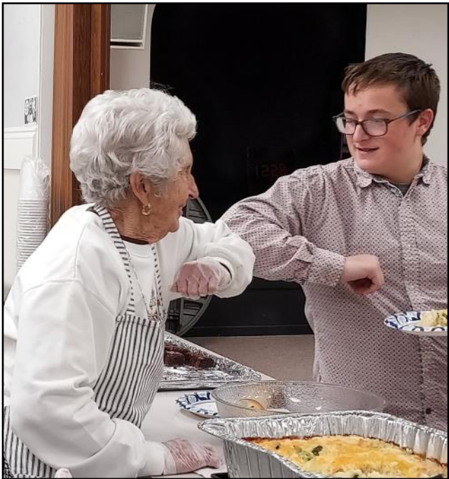
BJ bumps elbows with an athlete during the Special Olympics dinner Nov. 8.

Thank you all for helping us welcome the strangers among us.