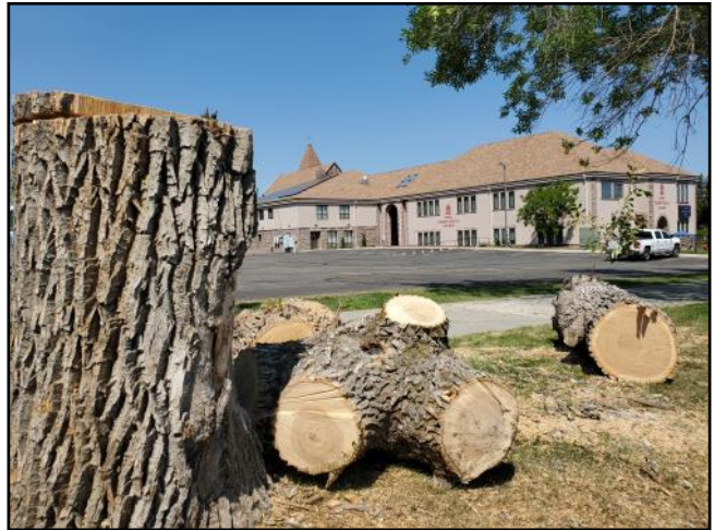
Work on Rodney Street continues, along with the trimming and removal of several trees. In the meantime, be prepared to use Ewing Street to access our parking lot.

FPC's Session is in discussions with a potential candidate. The candidate's identity is being withheld to allow the candidate to give proper notice to others who will be affected. Watch bulletins for updates.