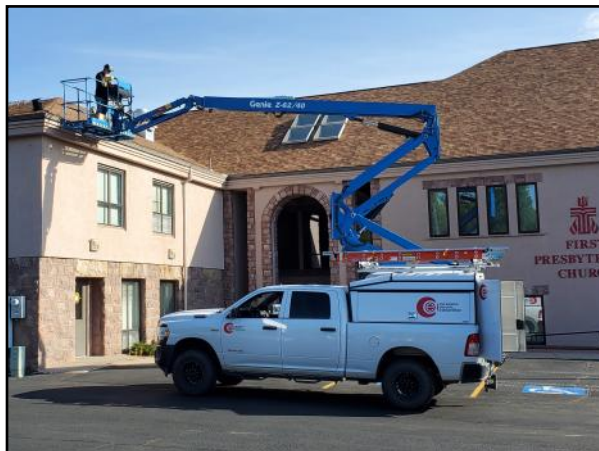
Installing heat cable to prevent ice dams.