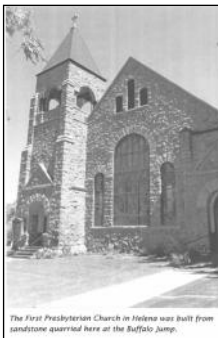
The First Presbyterian Church in Helena was built from sandstone quarried here at the Buffalo Jump.