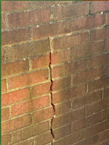
Cracks and missing mortar