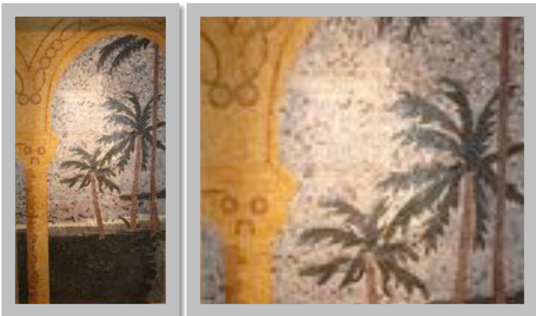
INDIVIDUALLY HAND-PLACED TILE MOSAIC