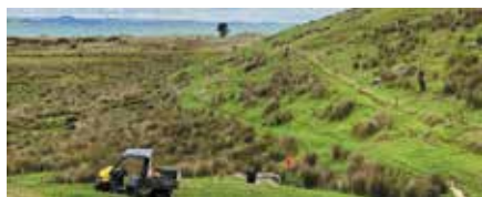
Caption: Halo Project works with landowner to fence-off a regionally significant wetland at Kaikai.