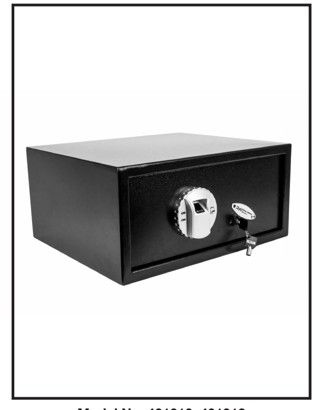
Model No. 401010, 401012

Read the instructions and precautions before use of this product