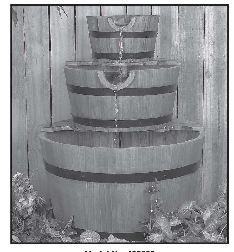
Model No. 402003

Read the instructions and precautions before use of this product