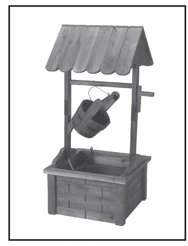
Model No. 402006

Read the instructions and precautions before use of this product