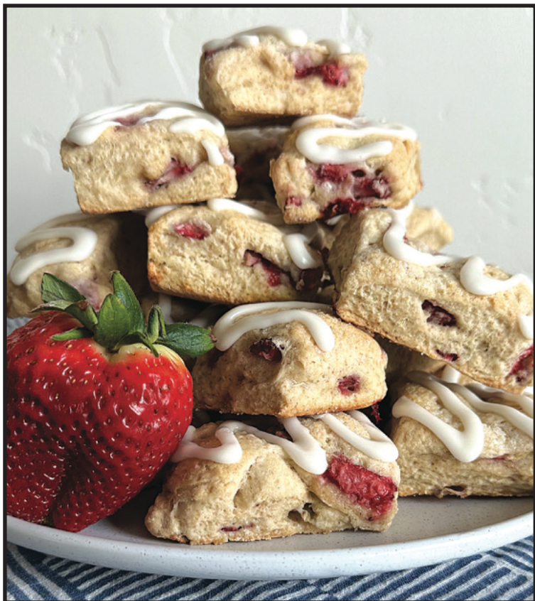
Strawberry Lemon Scones (made by Jennifer)

a generously floured board and pull it together into a 3/4 inch thick circle. Cut into 12 equal-sized wedges and transfer them to the parchment-lined baking sheet.