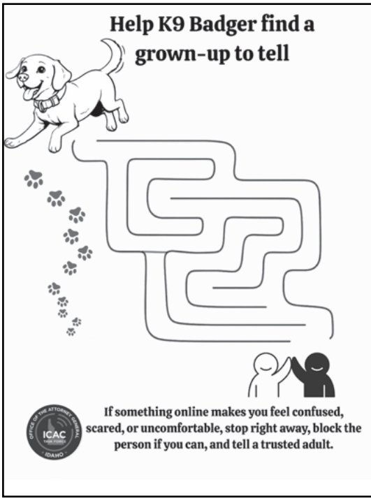
A page from ICAC's new internet safety guide for kids, "K9 Badger's Internet Safety Adventure"

by Deborah Kraft – Canyon County Anti-Trafficking Task Force