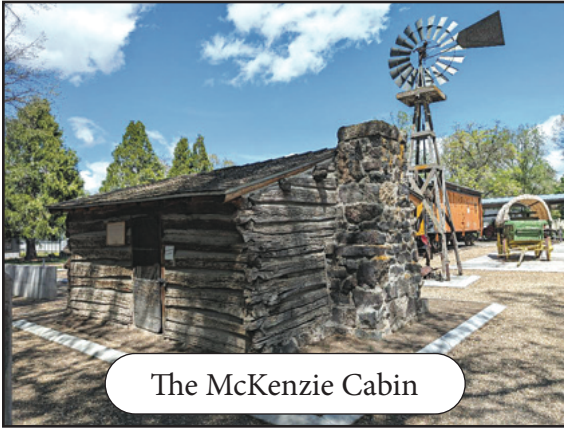
The McKenzie Cabin