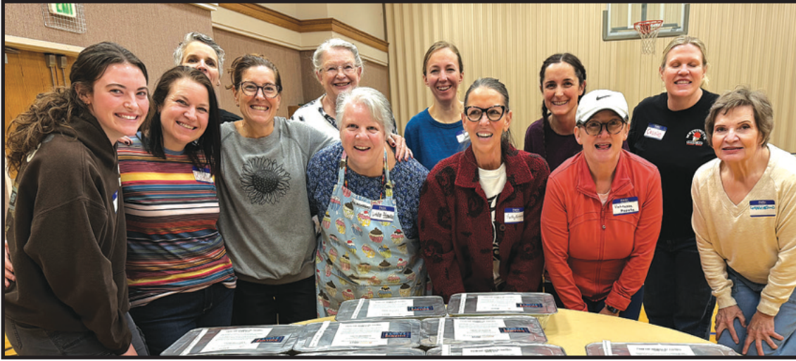
Lasagna Love Service