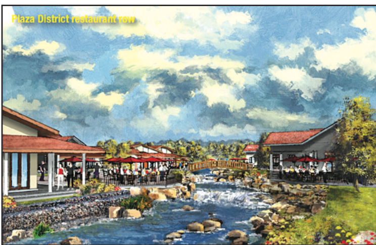
Plaza District Restaurant Row Rendering