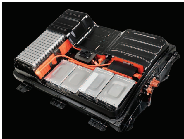
FIGURE 1. A Nissan Leaf battery pack.

Something had to give, and that something was the (new) Nissan Leaf capacity warranty as previously described. This isn't something that happens all at once; thanks to the battery capacity gauge Nissan placed in the dash alongside the fuel capacity gauge, owners can follow the degradation of their battery pack bar-by-bar (there are 12 capacity—and fuel—bars total). I dropped my first capacity bar around the two-year mark, the second capacity bar around the three-year mark, and the third and fourth capacity bars in the fourth year; at that point, I qualified for a warranty battery pack replacement. The trip to the dealer for the warranty verification initiated a month-long process whereby a brand new battery pack (with an improved