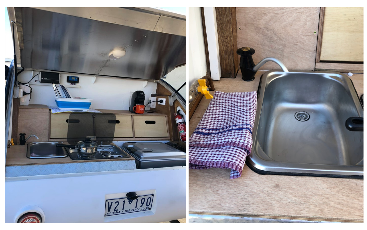
GoPod 90 Kitchen. You can see gas valve on the left hand side of kitchen