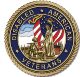
Disabled American Veterans