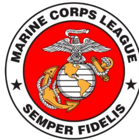
Marine Corps League