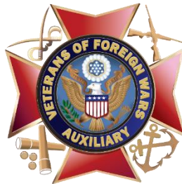
Veterans of Foreign Wars Auxiliary