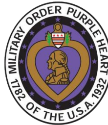
Military Order of the Purple Heart