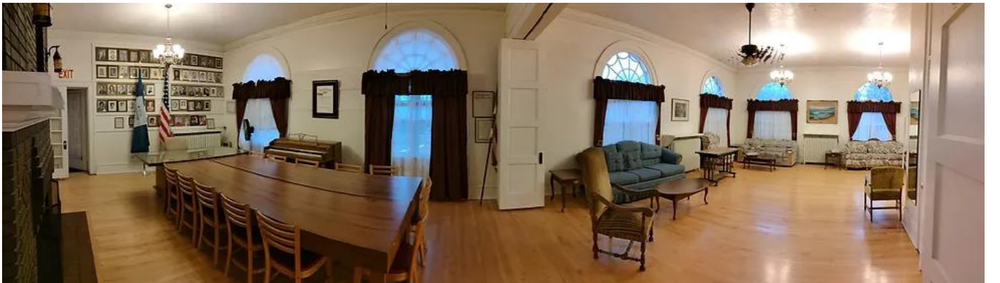
WAR MOTHERS ROOM