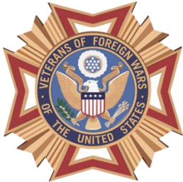
Veterans of Foreign Wars