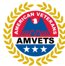
AMVETS Bengals Post 1901