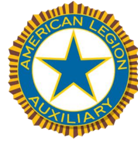
American Legion Auxiliary