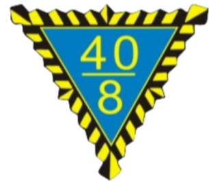
Forty and Eight