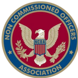
Non Commissioned Officers Association