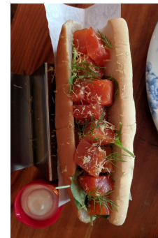
Top: Glacier Lagoon. L: National curriculum. R: Salmon dog.

Food is excellent: Langoustine, Arctic char, cod, dung-smoked salmon, lamb, cheese, ice cream, bread! And in the summer Iceland has over 20 hours of daylight. Long days for touring.