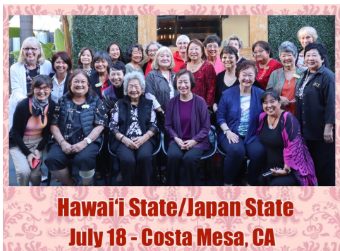
Technology in the arts, leadership, research, education, and the future was the theme of the conference.

Kapālama. Her kuleana covers oversight of its K–12 Multi-Tiered Systems of Support, Religious Services, Parent and Alumni Relations, Summer School, expansion and integration of partnerships that support student internships and career placement initiatives, and alignment of student activities K–12.