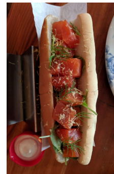
Top: Glacier Lagoon. L: National curriculum. R: Salmon dog.

Food is excellent: Langoustine, Arctic char, cod, dung-smoked salmon, lamb, cheese, ice cream, bread! And in the summer Iceland has over 20 hours of daylight. Long days for touring.