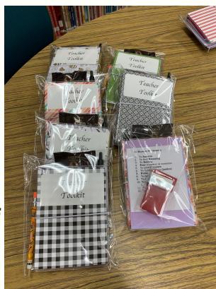
Theta's Teacher Toolkits