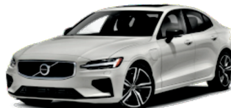
Volvo S60 Recharge $51,950 41 / 530 electric total miles