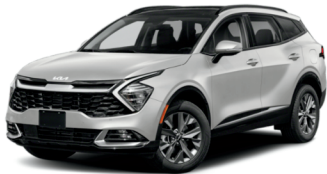
Kia Sportage Plug-In Hybrid $39,590 34 / 430 electric total miles