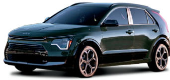
Kia Niro PHEV $34,390 31 / 510 electric total miles