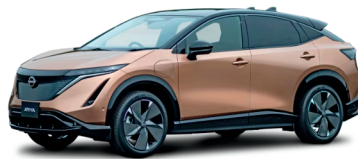
Nissan Ariya $39,590 216-304 miles