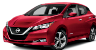
Nissan Leaf $28,140 149-212 miles