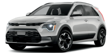
Kia Niro EV $39,900 253 miles