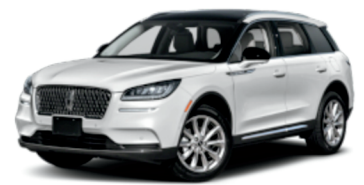
Lincoln Corsair Grand Touring $54,025 28 / 430 electric total miles

Find more plug-in hybrids at PlugStar.com