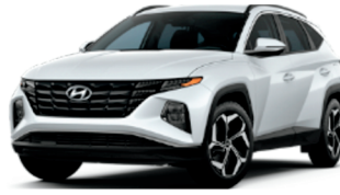
Hyundai Tucson Plug-In Hybrid $38,725 33 / 420 electric total miles