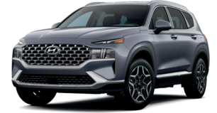
Hyundai Santa Fe Plug-In Hybrid $42,410 36 / 440 electric total miles