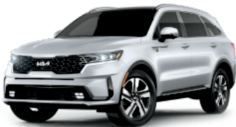
Kia Sorento Plug-In $50,290 32 / 460 electric total miles