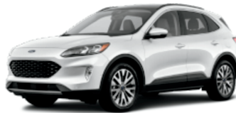
Ford Escape PHEV $40,500 37 / 520 electric total miles