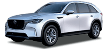
Mazda CX-90 $49,945 26 / 490 electric total miles