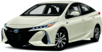
Toyota Prius Prime $32,975 39 / 600 electric total miles