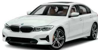
BMW 330e $45,600 22 / 320 electric total miles