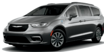
Chrysler Pacifica Hybrid $51,055 32 / 520 electric total miles