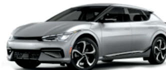
Kia EV6 $42,600 206-310 miles