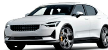
Polestar 2 $49,900 260-270 miles