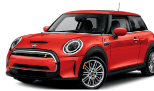
Mini SE Hardtop $30,900 114 miles