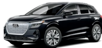
Audi Q4 E-Tron $49,800 236-265 miles