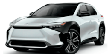
Toyota bZ4X $43,070 222-252 miles