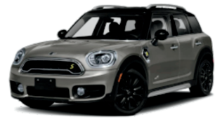
Mini Countryman SE All4 $38,900 12 / 270 electric total miles