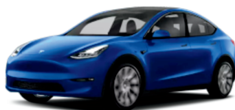
Tesla Model Y $44,990 279-330 miles