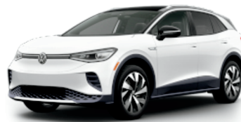
VW ID.4 $39,735 209-275 miles