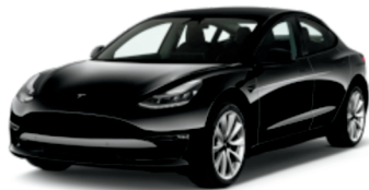
Tesla Model 3 $38,990 272-358 miles