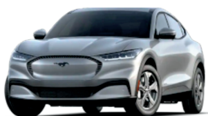
Ford Mustang Mach-E $39,995 247-314 miles