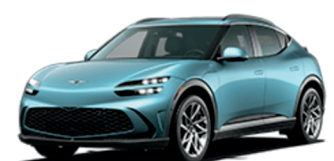
Genesis GV60 $52,000 235-248 miles