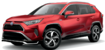
Toyota RAV4 Prime $43,690 42 / 600 electric total miles