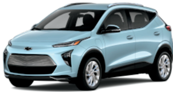
Chevy Bolt EV* / EUV* $27,495 259 miles