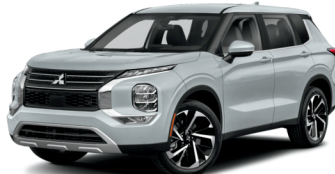
Mitsubishi Outlander PHEV $40,345 38 / 420 electric total miles