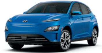
Hyundai Kona EV $32,675 258 miles