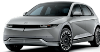
Hyundai Ioniq 5 $41,800 220-303 miles