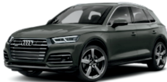
Audi Q5 PHEV $45,300 25 / 390 electric total miles