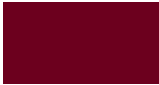
Equipment Red / 313