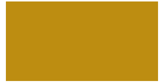
New Cat Yellow / 214