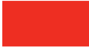
AC Orange / 511