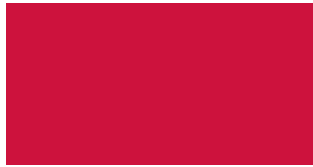
Swift Red / 311