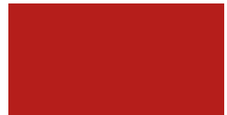
Safety Red / 314