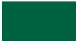
Safety Green / 613