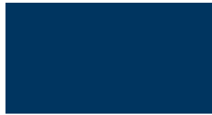
Harvester Blue / 412