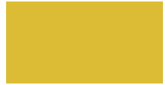
JD Yellow / 218