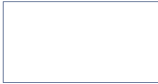
White / 100

Industry • Commerce • Institutions • New Construction • Repaint • Maintenance