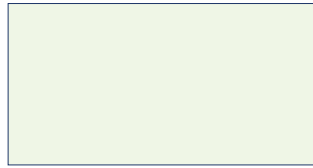
Special White / 109