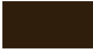
Industrial Brown / 220