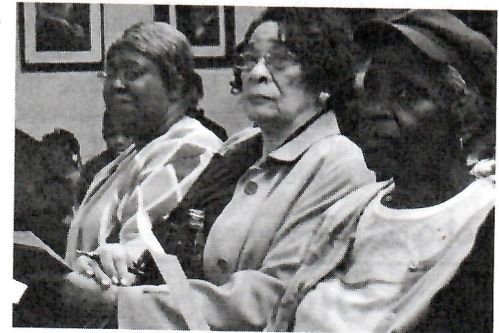
Concerned community residents listening intently during CEO Meeting