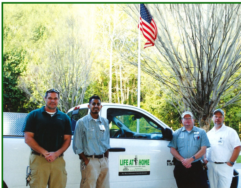
The "Life at Home" program is a pilot "handyman" program sponsored by the Brookridge Community designed to help extend the time the "Oldest Old" can stay in their homes.

Making Life for Older Adults the Best of Times: