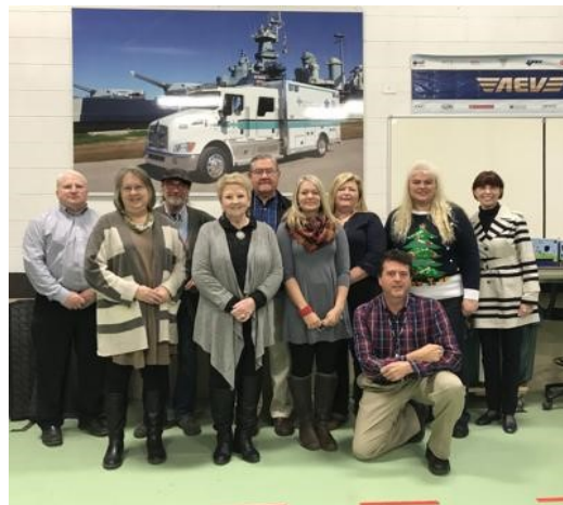
AEV Employees donate to local charities

Sponsored by FaithHealth of Ashe and Ashe Baptist Association.