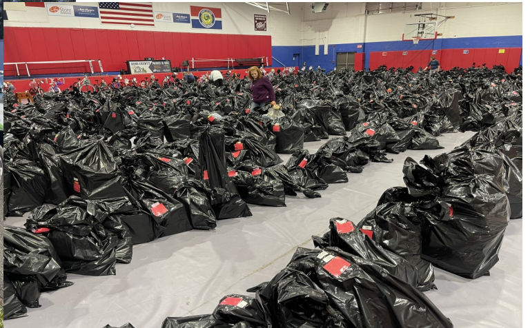
Members of Kinza Baptist Church from Stanley County brought Back Packs for each child.