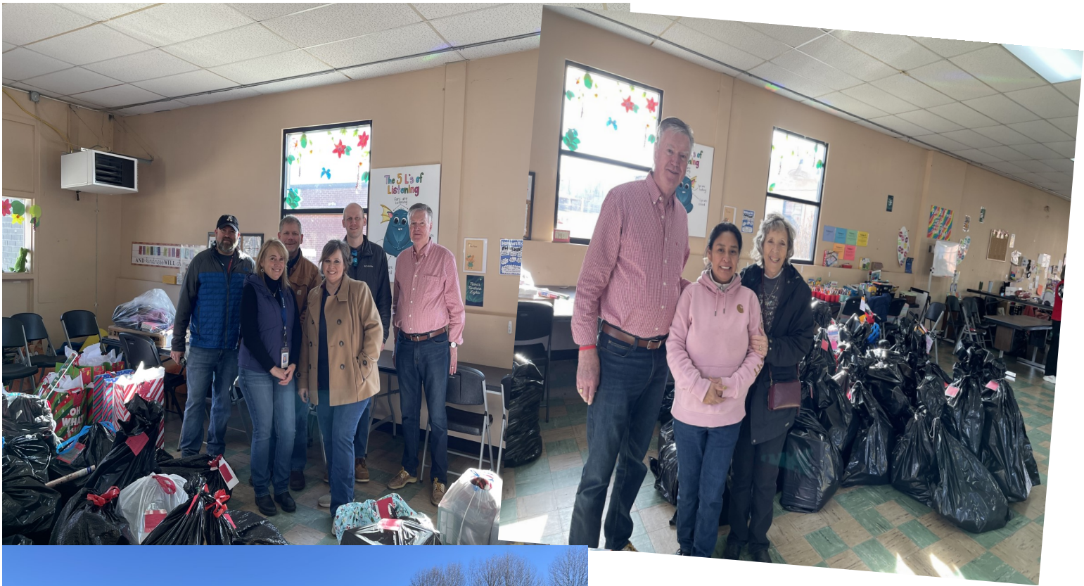
Gifts coming in from many, many donors and all gifts now on the gym floor at Family Central!!!!