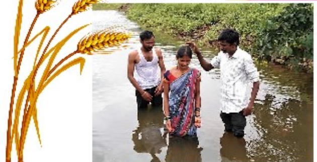
The Harvest is FULL....Matthew 9:37