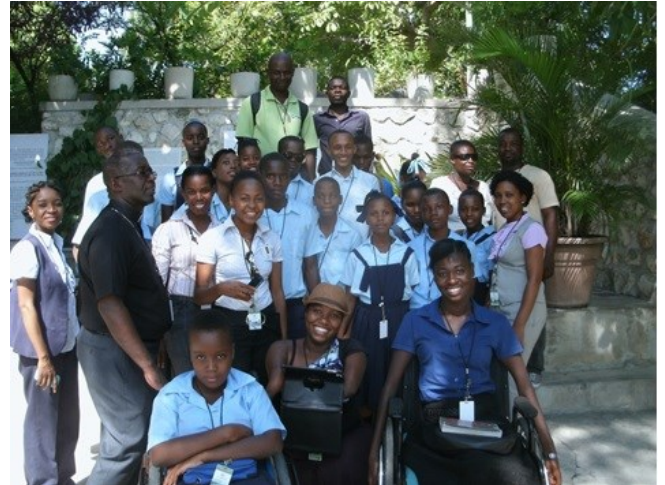
St. Vincent's students on a recent field trip to nearby Botanical Park.