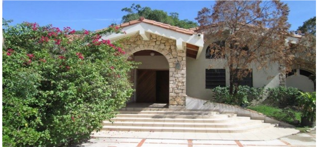
This beautiful home, located in the northern suburbs of Port-au-Prince, Haiti, along with its seven acres, now belongs to the Episcopal Diocese of Haiti and will become the new home of the St. Vincent's Centre.