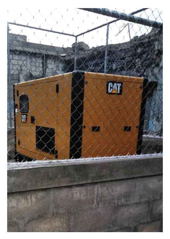
The new generator was installed during the last week of June inside this fence-protected site and within the secure walls of the Medical Center.