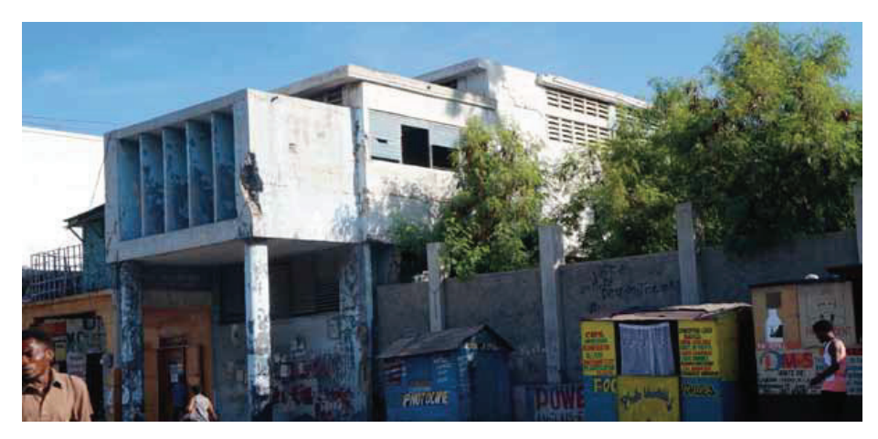
This building on the Medical Center campus has been vacant since damaged by the earthquake in 2010. July will see its demolition and removal to make room for additional development of the downtown Center.

After the old "blue" building is removed, the perimeter wall will be reconstructed making the site secure. Security cameras will be placed throughout the site.