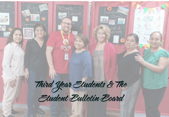
Third Year Students & The Student Bulletin Board