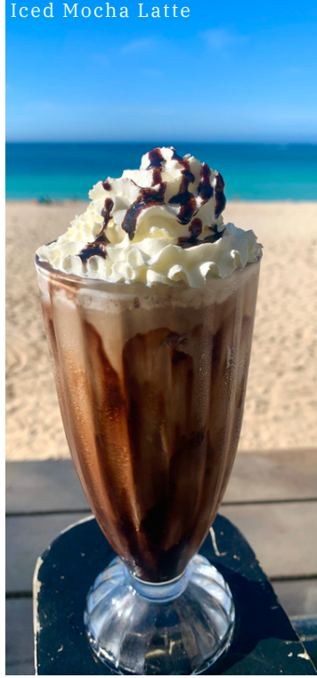
Iced Mocha Latte