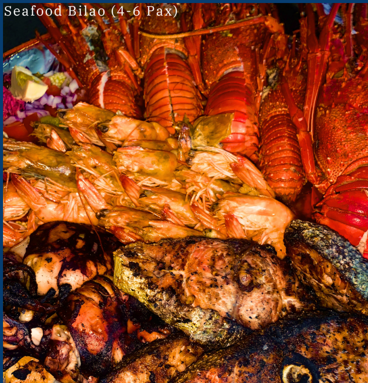
Seafood Bilao (4-6 Pax)

If either is unavailable, may be replaced with additional: Fish, Squid or Shrimp