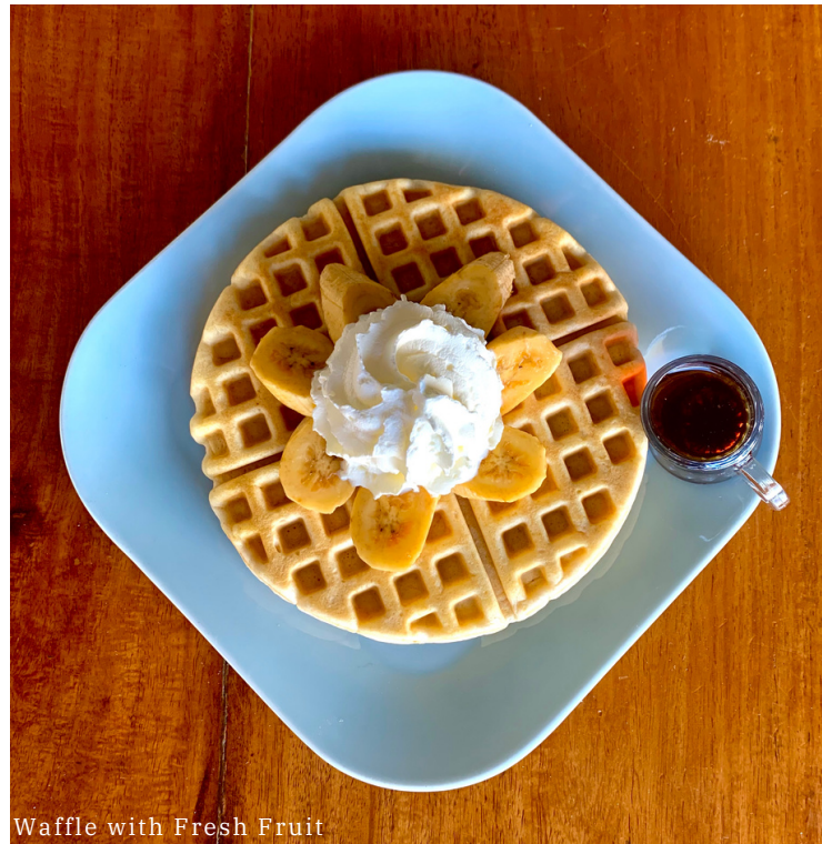
Waffle with Fresh Fruit