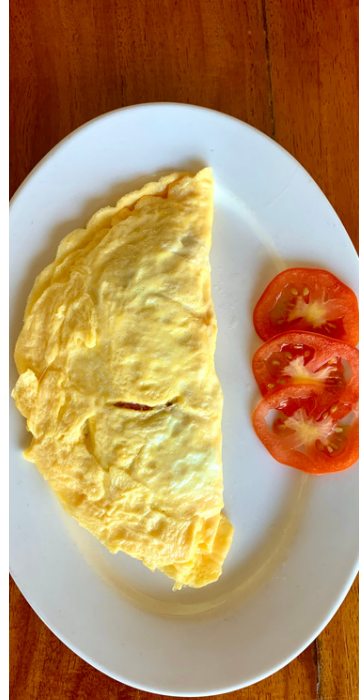
Tomato and Onion Omelette