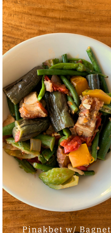
Pinakbet w/ Bagnet