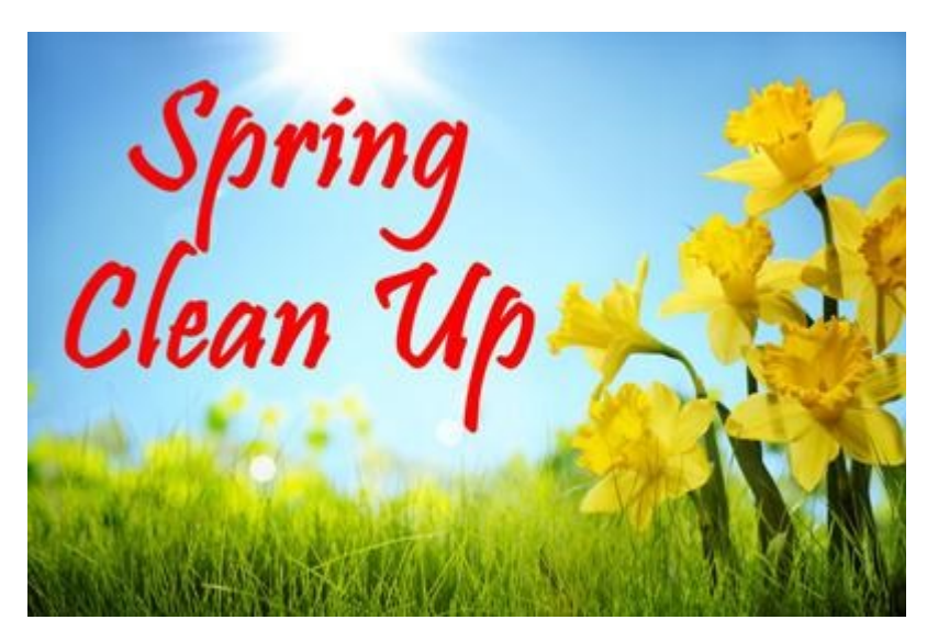
Saturday, April 9th from 10am - noon (Rain date April 16th) Volunteers needed! Sign-up sheet in narthex or call the church to add your name.