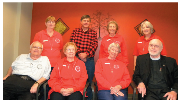
American Board of Directors, 2018