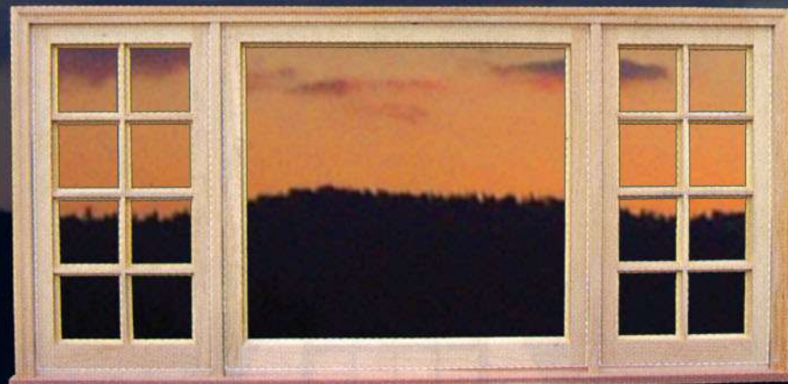
COMBINATIONS Casements: Swing in, push out, or crank out CSMT/Fixed/CSMT Double hungs: Acme balance or vinyl jambliner DH/Fixed/DH Available in 1/4 1/2 1/4, 1/3 1/3 1/3, or custom flanker widths