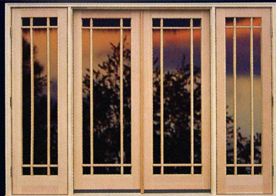
PATIO SWING SETS Swing in or swing out patio door unit, side lites available as stationary, swing in, push out or crank out