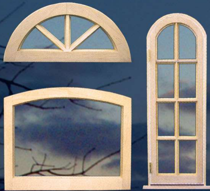
CIRCLE or SEGMENT HEAD RADIUS PRODUCTS Casements: Swing in, push out, or crank out. Doors: Swing in or swing out