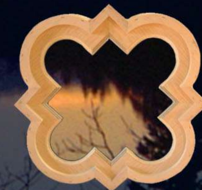
QUADRAFOIL WINDOW Stationary

The Highest Ranked Wood Windows & Doors in the Industry