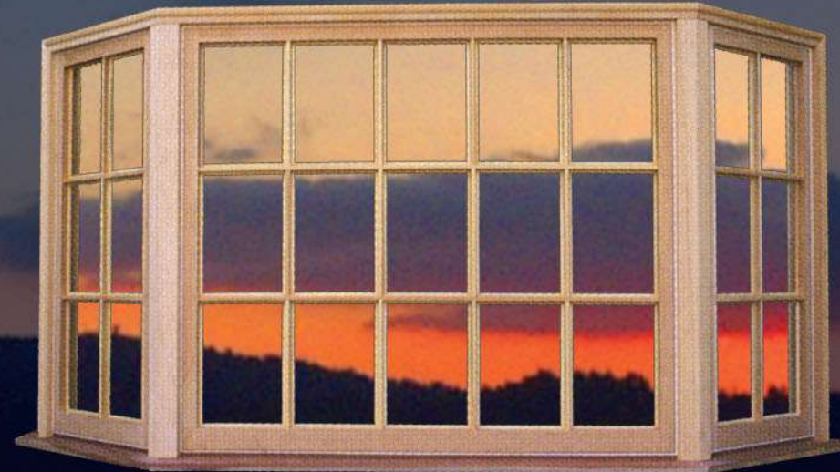
BAY WINDOWS Casement or double hung flankers, stationary center, Available in 30°, 45°, 60°, or 90° angles