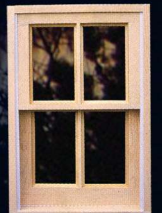
DOUBLE HUNG Acme balances, or vinyl jambliners Jambliners available in white or tan