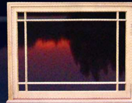
STATIONARIES, AWNINGS & HOPPERS Stationaries: Non-operating fixed sash or direct set glass Awnings: Push out or crank out Hoppers: Swing in

The Highest Ranked Wood Windows & Doors in the Industry