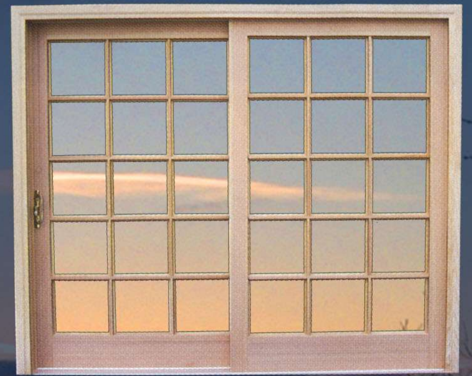
SLIDING FRENCH DOORS Horizontal sliding patio door units available in XO, OX, or OXXO handings