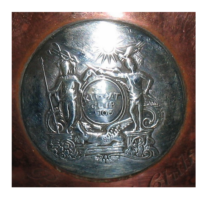
An ersatz Kit-Cat Club coat of arms on a copper and silver serving bowl.

ORIGINAL GRAVY RECIPE (to accompany pie no.4 above, or pie no.1)