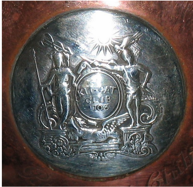
An ersatz Kit-Cat Club coat of arms on a copper and silver serving bowl.