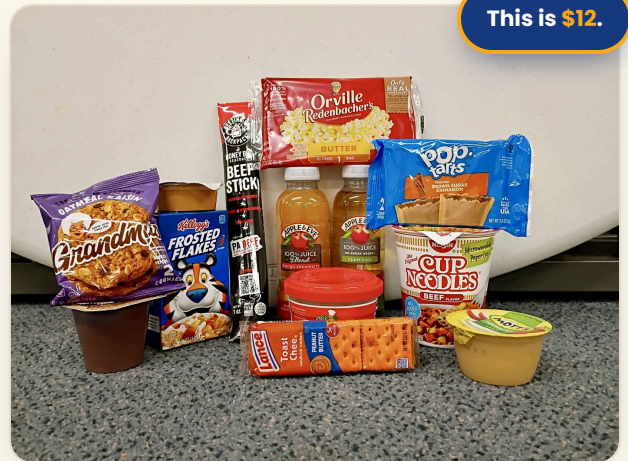
Every $12 bag holds a weekend of single-serving meals – breakfast, lunch, snacks & protein.

Every weekend, our volunteers quietly tuck a backpack of kid-friendly meals into those students' bags. Since 2015 the program has grown from 35 backpacks a week to more than 200 – powered entirely by this community.