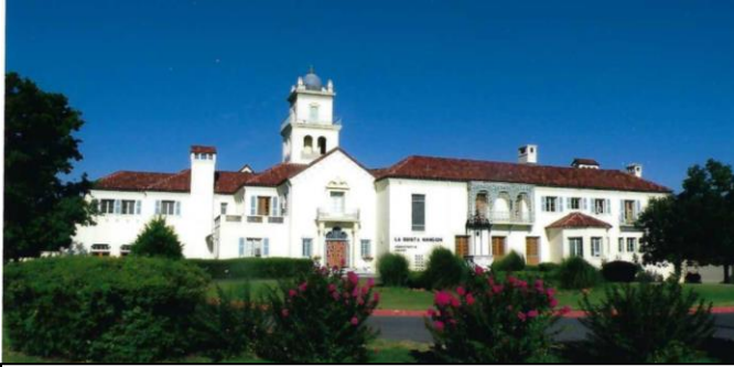
The administration building of Central Christian College.

The preacher who performed their wedding ceremony recommended that