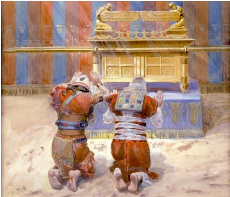
Artist's conception of how the Ark of the Covenant may have looked, with priest's bowing before it. The Lord ordered that the Ark be carried with poles placed through rings at its four corners. Four chosen men were to carry it.

spoke of, I will be held in honor.” And Michal daughter of Saul had no children to the day of her death.