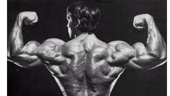
This is Arnold Schwarzenegger. I don’t know the name of Merv Griffin’s guest.

“The body builder stepped forward and flexed a series of well-defined muscles from chest to calf.”