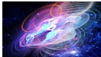
FreeStockPhoto of outerspace

They look for evidence of life on Mars or in outer space.