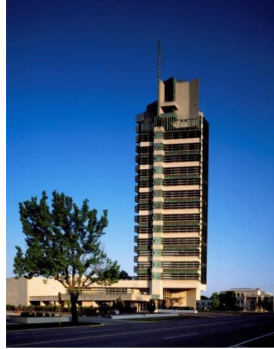
The Price Tower in Bartlesville, OK designed by Frank Lloyd Wright

Her uncomplaining act that day, and many since, keep making me want to recommit to our marriage. I want to make her happy not just with me, but especially in the Lord.