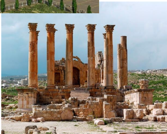
Remains of the temple today.

This created considerable income for the city.