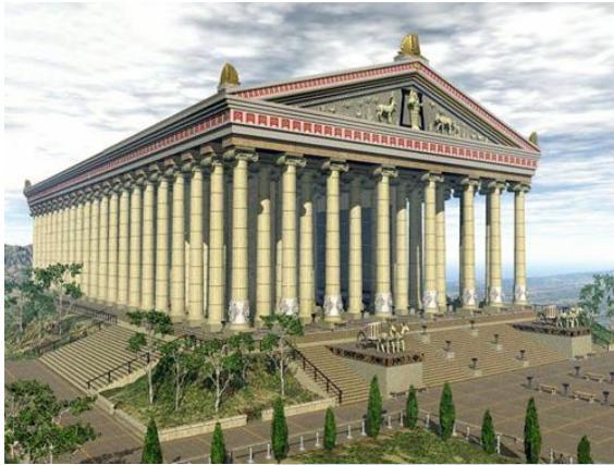
How the Ephesus-Artemis temple probably looked in the first century AD.

Craftsmen made and sold replicas of the temple that contained Diana's image.