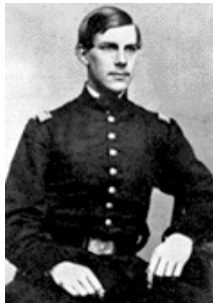
Captain Oliver Wendell Holmes, Jr.

Other presidents might not have been as tolerant of a young officer being his true self.