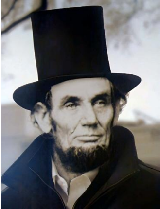
Lincoln