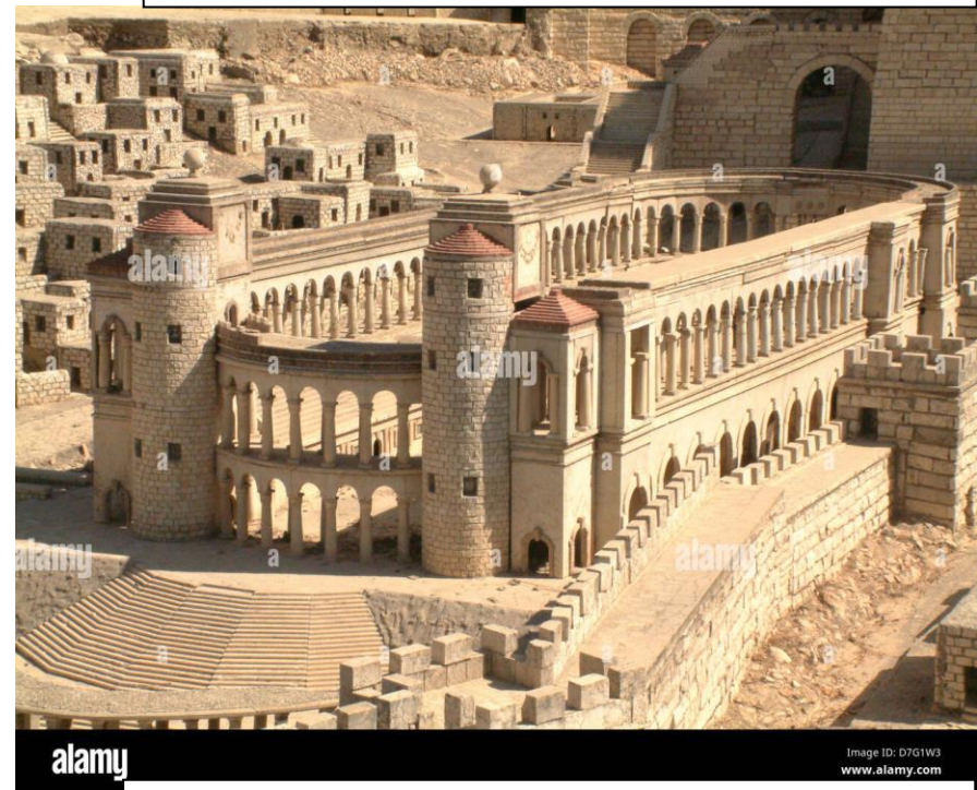
alamy photo of model city of Jerusalem (1st Century).