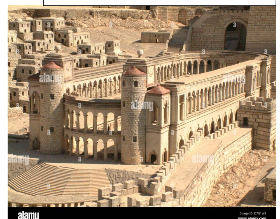
alamy photo of model city of Jerusalem (1st Century).

Times of Israel photo of the Caesarea amphitheater, originally built by King Herod the Great; died 4 BC.