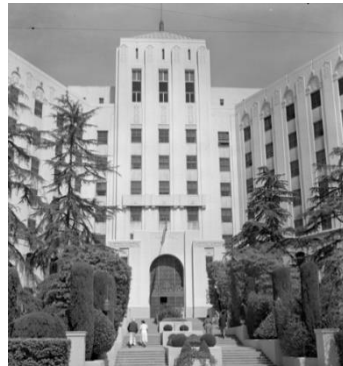
Old Cedars of Lebanon Hospital, LA

famous TV news program of that era. He and his attractive wife lived in a stylish Hollywood Hills home.