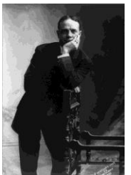
Billy Sunday; I don't know if he was the one who said this.

“Well it's this way. The Lord done voted for my salvation. The devil done voted for