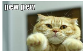
Get out of my pew!

A church usher was instructing a young successor in the details of his office. "And remember, my boy," he concluded, "that we have nothing but good kind Christians in this church until you try to seat someone else in their pew."