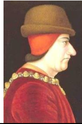
King Louis XI of France

Concerning Jesus’ statements that the kingdom is “at hand” and will come with power, others scratch their heads.