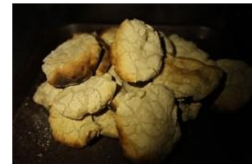
Loaves baked by ancient method.