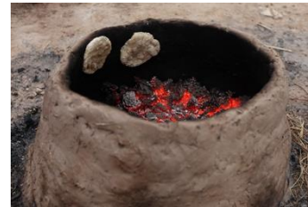
Ancient style tannur or oven.

Their loaves of bread did not resemble the loaves we buy at grocery stores today.