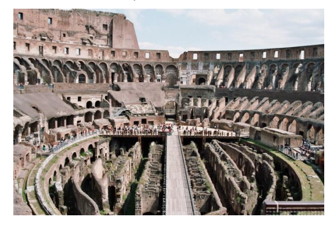
Many thirsty Roman citizens watching gladiator contests probably never knew that precious water ran beneath them.

Roman engineers designed a main water system that ran under some seats of Rome's 50,000 seat Colosseum.