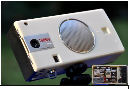
Black and silver version of a Ramera.

The manufacturer called this a "Ramera."