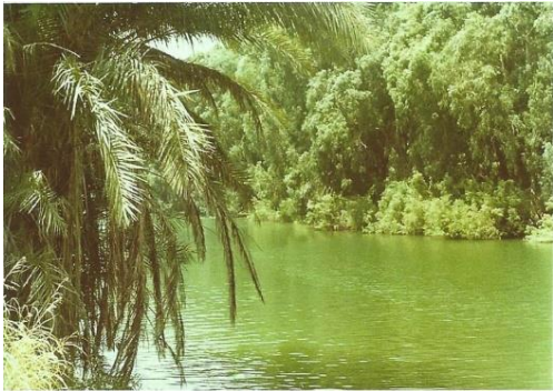
1980 photo of the Jordan

When John baptized Jesus in the Jordan River, as soon as Jesus came up out of the water, the Holy Spirit descended on Jesus as a dove. 5