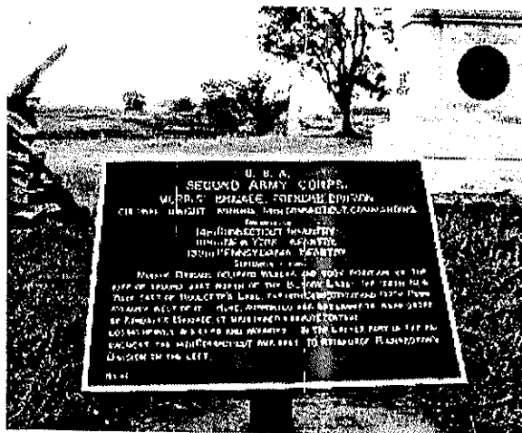
Marker to Morris's Brigade at Antietam

Morris' Brigade relieved Weber's and took position on the rise of ground just north of the Bloody Lane; the 108th New York east of Roulette's Lane, the 14th Connecticut and 130th Pennsylvania west of it. Here supported and afterwards reinforced by Kimball's Brigade, it maintained a severe contest, losing heavily in killed and wounded. In the latter part of the engagement, the 14th Connecticut was sent to reinforce Richardson's Division on the left.