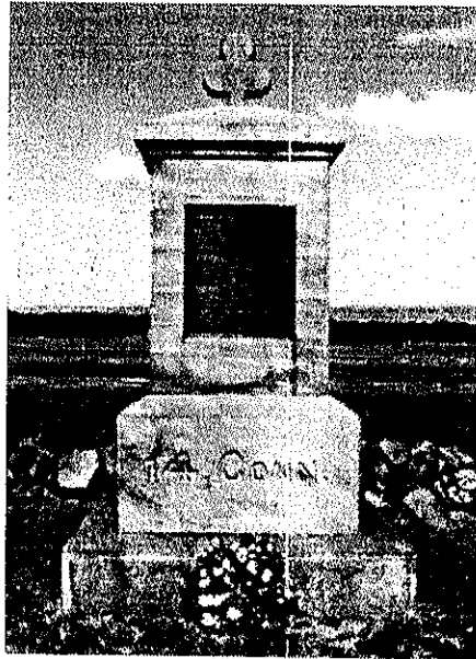
Monument to the 14th Connecticut Infantry at Gettysburg